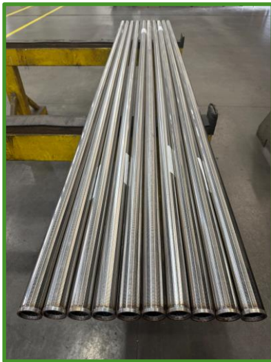
Made-to-order wedge wire screens for pump protection