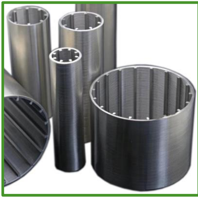
Customized diameters, lengths, slot spacing, connection ends and material options