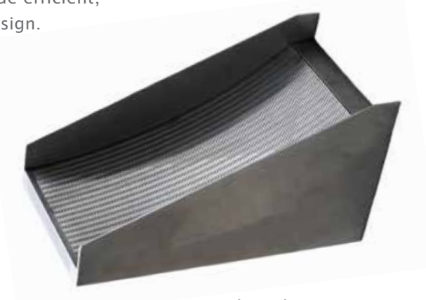
Sieve bend screens